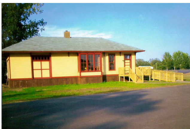
THE NEW STONE LAKE DEPOT/MUSEUM